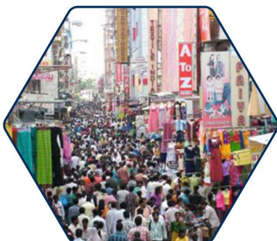
T - NAGAR